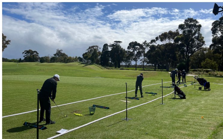
TOPTRACER RANGE TECHNOLOGY