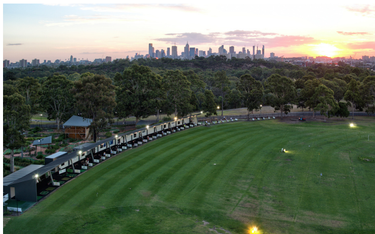
FULL FLIGHT DRIVING RANGE BALLS